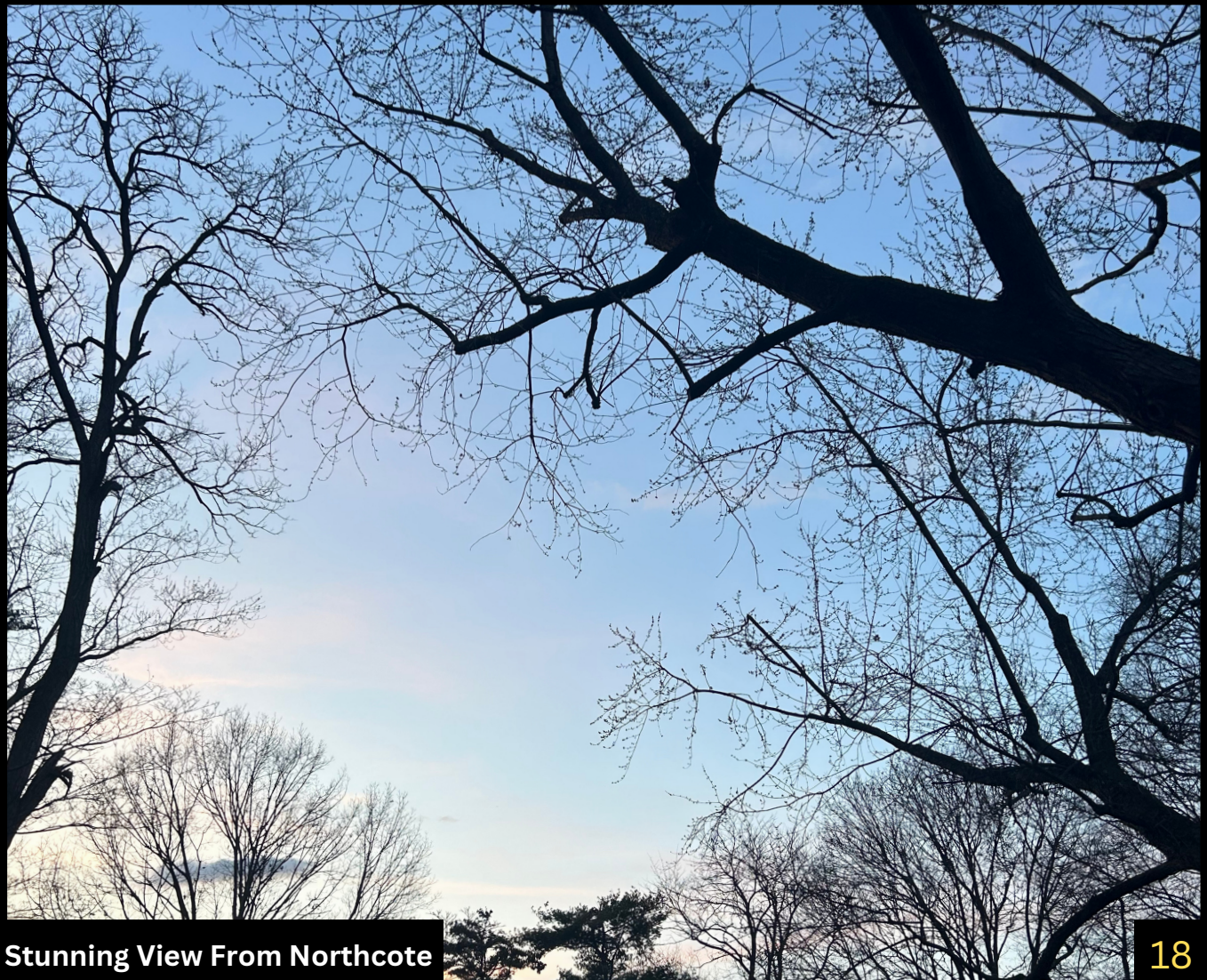
Stunning View From Northcote